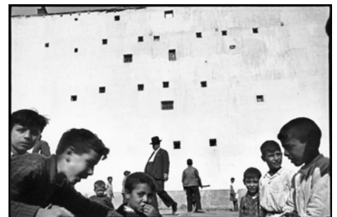
Henri- Cartier Bresson