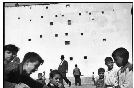
Henri- Cartier Bresson